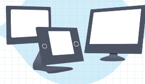
Home Automation / BMS